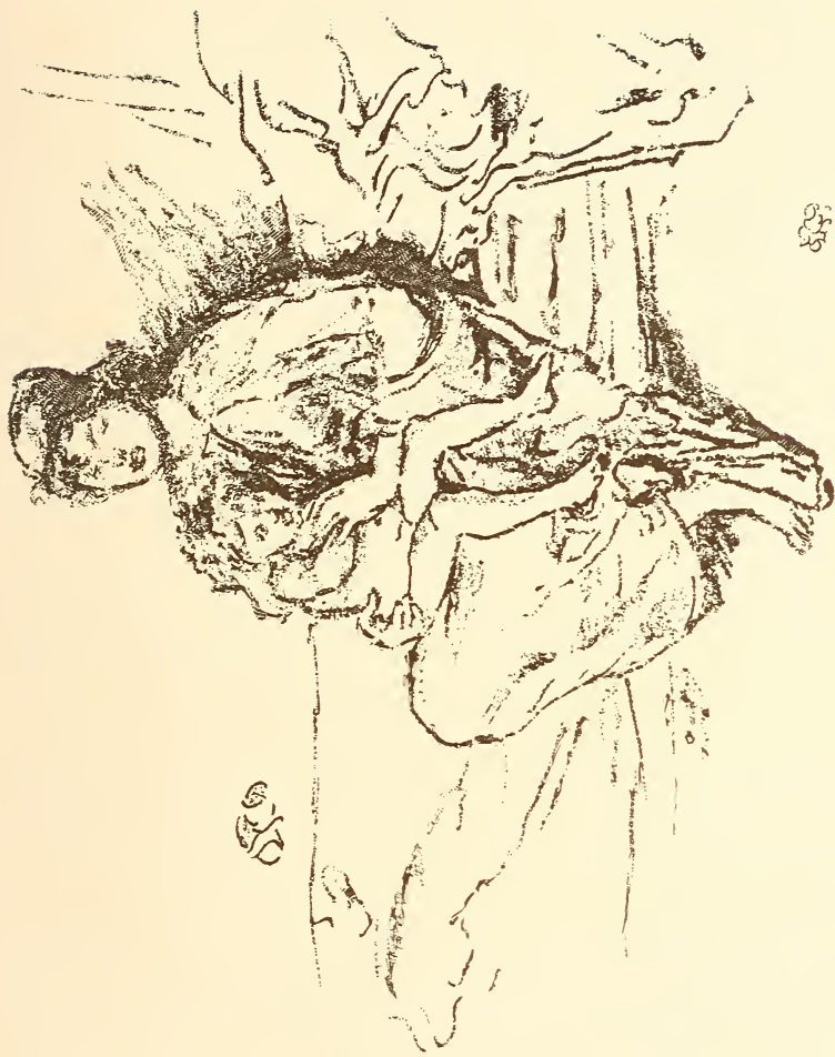
MOTHER AND CHILD, No. 2. (From Lithograph.)